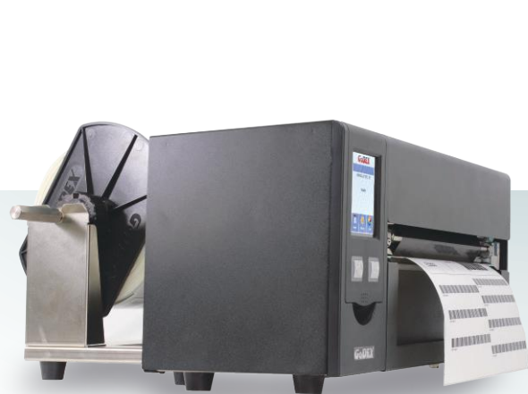
External Label Stand :10" Max. (Standard Package included)

GoDEX's HD830i is an eight-inch barcode printer designed for applications that require large and durable labels. The HD830i is a rugged printer of exquisite design which includes significant characteristics of high performance electronics, reliable mechanism, user -friendliness and easy maintenance design.